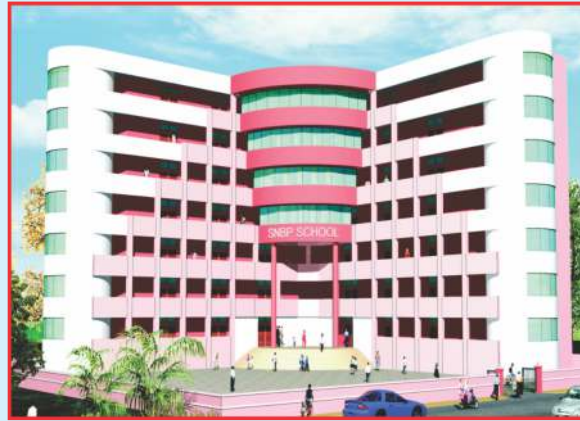
S.N.B.P. School & Junior College Pimpri Ph.: 020 27488628