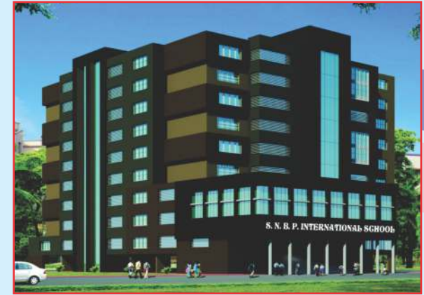
S.N.B.P. School & Junior College Rahatani Ph.: 7774059629